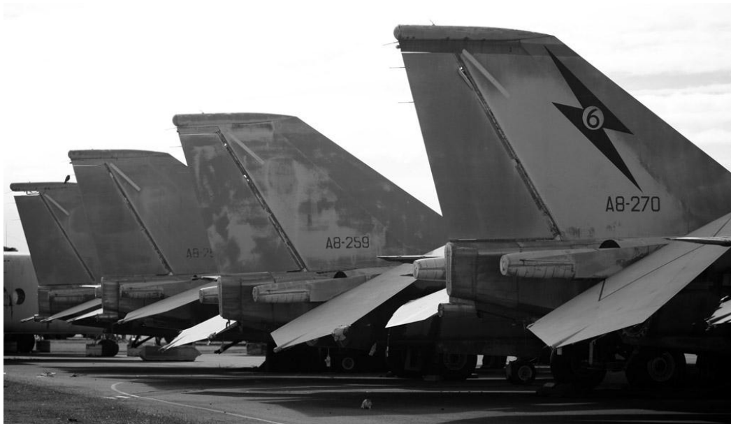
Pigs A8-259 and A8-270(With earlier 90's style 6 Sqn Markings).Message Board

The RAAF also received pre-production F-111A 63-9768 as a training aid. The RAAF has the forward fuselage of FB-111A 68-0246 mounted on a trailer.