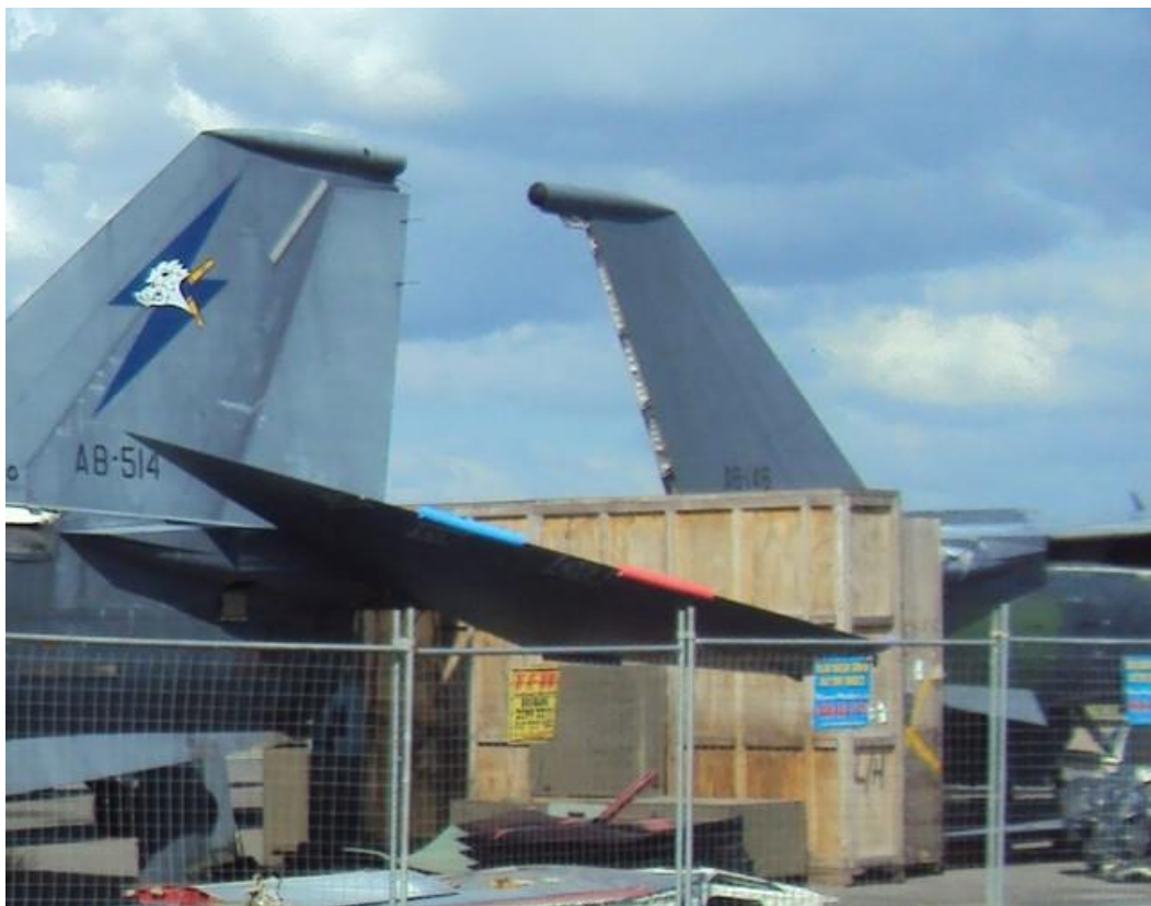
Figs A8-514 and A8-146 both undergoing parts reclamation. Message Board