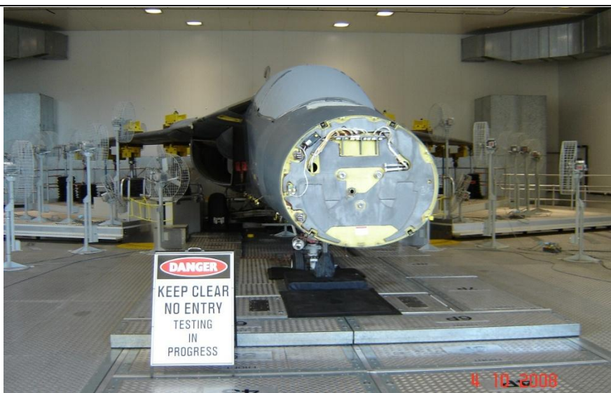
A8-506 in Cold Test: 2008