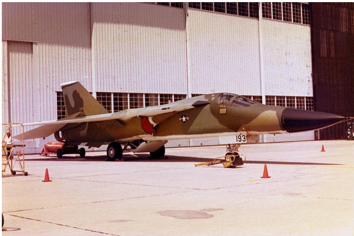
Fresh out of the pen circa 1970; Pig FB-111A 67-7193

In 1999 F-111A 67-0106 (Previously earmarked as a F-111C attrition replacement in 1982) arrived by sea for fatigue and corrosion tests at DSTO.