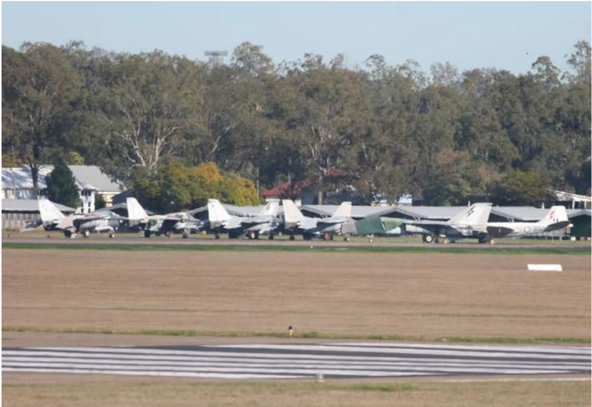
F-111Gs parked waiting for the scrappers with GAF Canberra A84-203 in the background