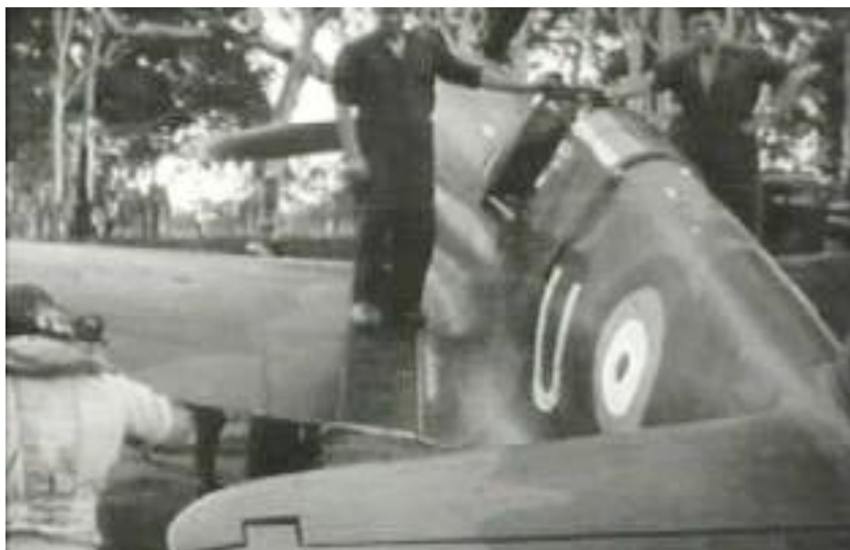
Pictured mid March 1942 at Townsville

A29-18: Allotted 75 Sqn RAAF ex 1AD 08/03/42. Received E 75Sqn 16/03/42. Coded "U" 75Sqn. 23/03/42 ground strafed by enemy aircraft, cannon shot through engine. 24/03/42, Requires new engine only. 24/03/42 Rec Moresby 21/03/42. 07/04/42 C at 75Sqn. 09/04/42 S/B U/C bent after hitting heap of blue metal on edge of runway whilst taking off. A/C landed on port main. S/B wheel collapsed. Extensive damage. 27/04/42 Unserviceable at 75Sqn. 22/05/42 allotted 5AD ex 75Sqn. 22/05/42 Rec 5AD ex 75Sqn. 25/05/42 G at 5AD. 19/06/42 Unserviceability indefinite. 26/06/42 Unserviceability indefinite. Being a P-40E model, no P-40E main planes available. Aircraft modified to take P-40E-1 main planes by 5AD. 03/07/42 estimated ready 10 days. 08/07/42 Allocated 2OTU ex 5AD. 10/07/42 completed 3 days. 15/07/42 Issued 2OTU ex 5AD. 20/07/42 Rec 2OTU ex 5AD. 27/07/42 Serv at 2OTU. 03/08/42 serv at 2OTU. Accident 02/10/42 when aircraft was ground looped on landing. 04/10/42 repairs necessary; starboard main plane, ailerons and wingtip damaged. 12/10/42 u/s 2OTU E Star. 19/10/42 u/s 2 OTU E Star. 26/10/42 u/s 2 OTU E Star. 02/11/42 u/s 2 OTU E Star. 09/11/42 u/s 2 OTU. Repaired. Accident 11.45hrs 09/06/43 when landing at Yelta satellite Strip. Aircraft caught fire in air and on final landing run, pilot abandoned moving aircraft. Pilot; F/Sgt McNeil Serv#411034 injured. AMSE approve Conversion. File 9/16/886 Min No 5 HQ QO680 06/07/43. Eng#5854 2OTU.