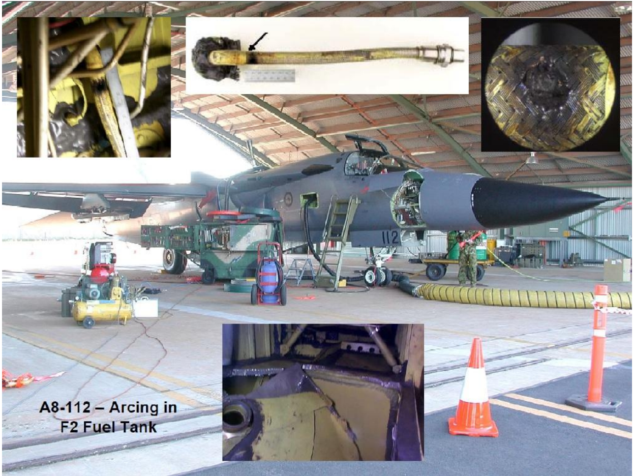
A8-112 again, this time Darwin 26/06/2002, and she did she fly again!