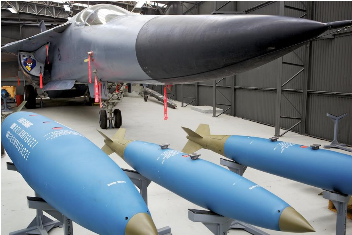
As she is now at Point Cook, A8-272 at rest

By 2008 only 12 F-111G aircraft were in storage awaiting disposal action with a further two F-111G's being already broken down to spares.