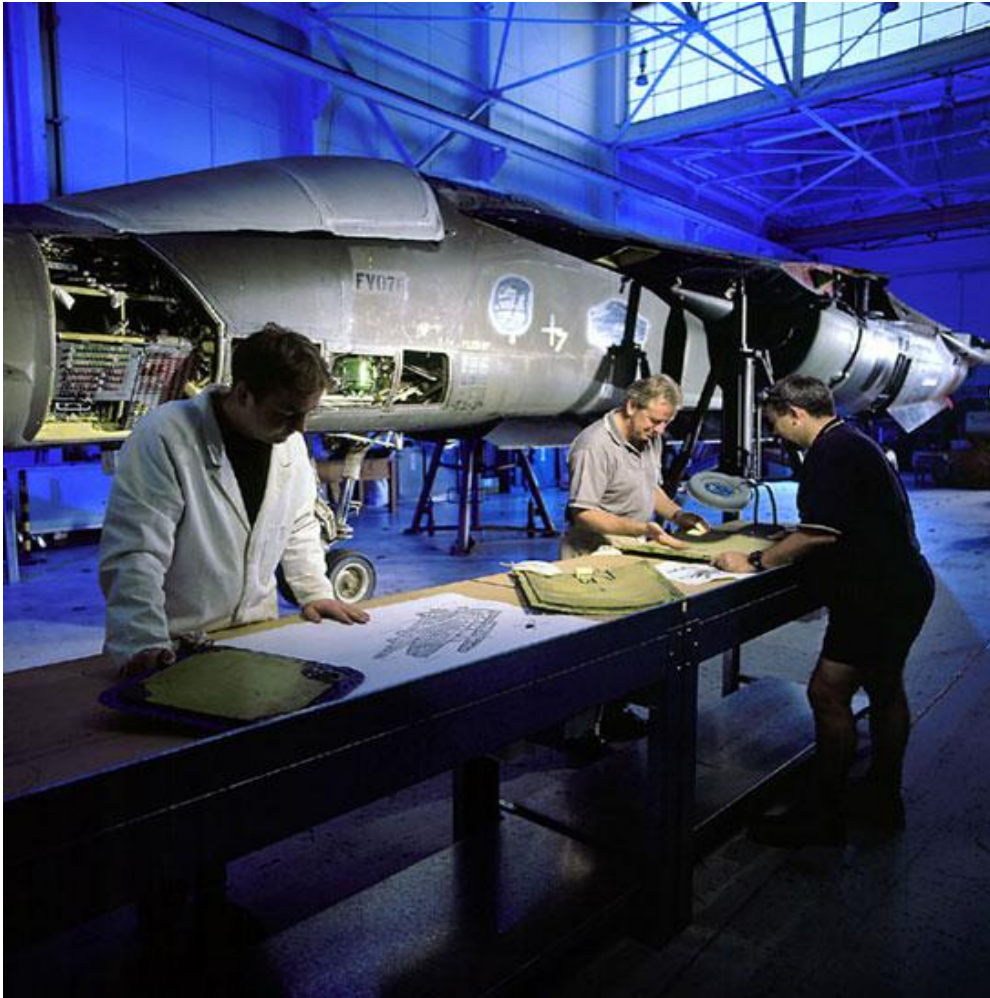
DSTO's F-111A 67-0106 ARMAC FV076 being prepared for strip down 1999.