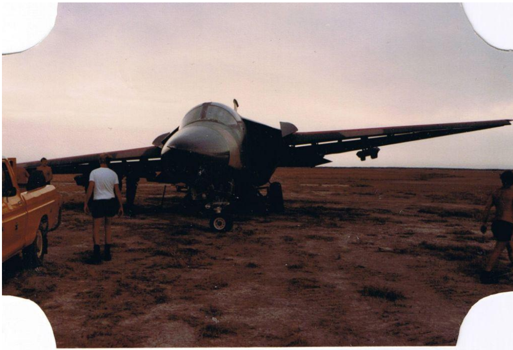
Date for A8-134 after an overrun or tyre blow out or taxiing accident at Woomera?